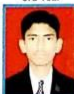
Math A.B. 1st Rank - 80.59%