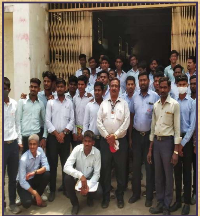
Marvel Engineering Pvt. Ltd. Solapur