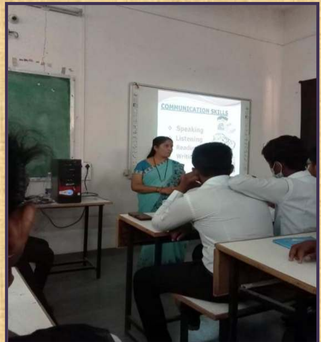
Experts interacting with student