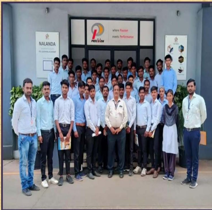
Precision Camshafts Ltd. Solapur