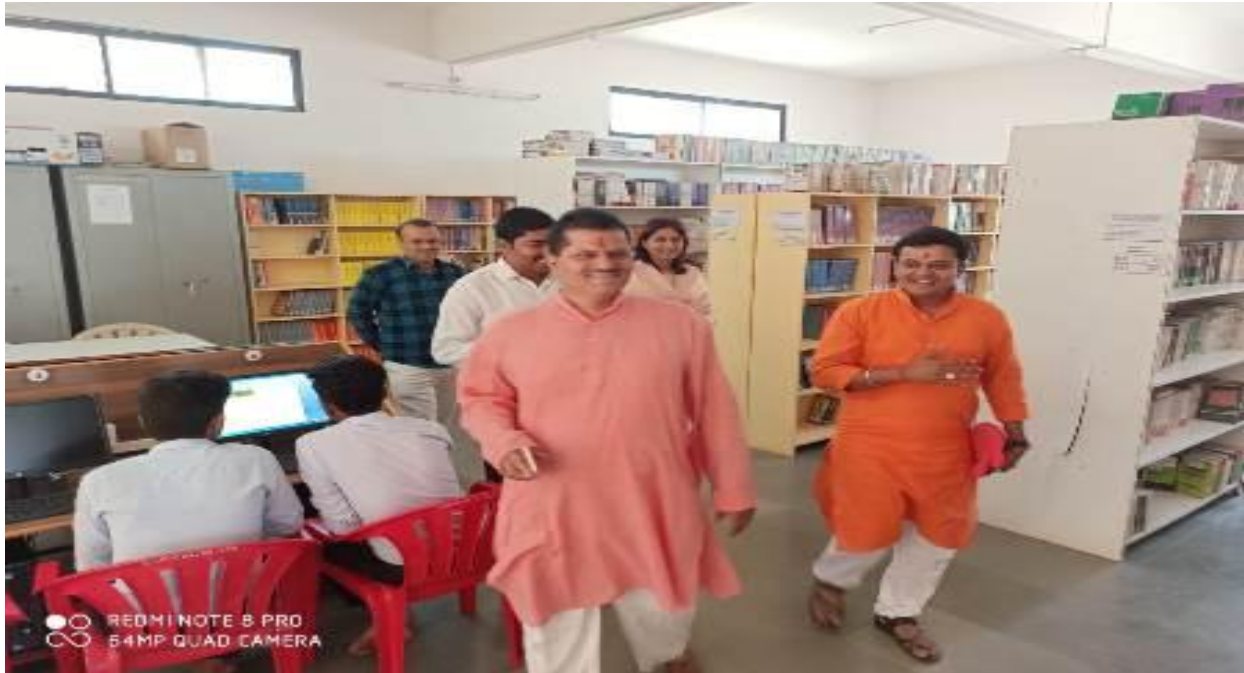
Digital Library Section